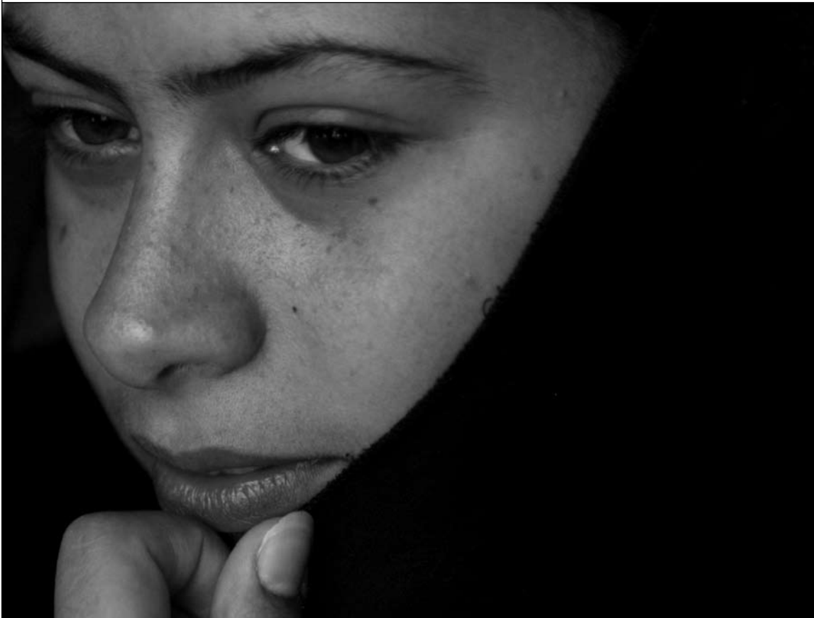
A seventeen-year-old Palestinian girl looks down inside of a tent at the refugee camp in the suburbs of Baghdad in 2003. Palestinian refugees inside Iraq are among the country's most vulnerable populations.