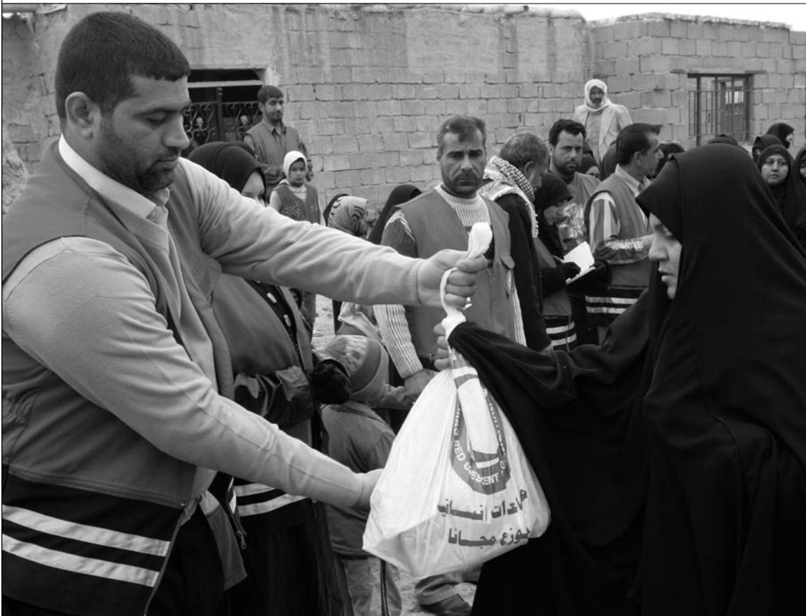
A woman receives humanitarian aid distributed by the Iraqi Red Crescent organization to poor families in Baghdad's Sadr City in February 2008.

With the fragmentation of Iraq, it is more essential than ever to work at a very localized level, with agencies that both understand the context and are known and respected by the community they seek to serve. It can be difficult to identify reliable non-political NGOs in Iraq, but they exist, and are doing the bulk of the work with limited means. The CAP