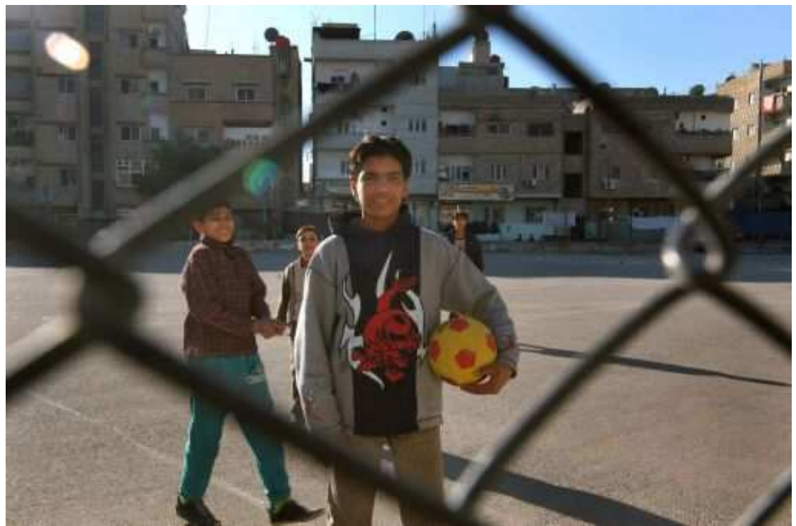
Young Iraqis playing football in a Damascus quarter, Syria © UNHCR/J.Wreford, January 2007

According to UNHCR and Syrian government officials, there are no restrictions preventing Iraqi children from attending schools in Syria. In June 2007 there were reported to be some 32,000 Iraqi children, aged between six and 18, attending public schools and about 1,000 children attending private schools. The total is low considering the estimated 1.4 million Iraqi refugees in Syria and the proportion of these who are likely to be children of school-going age.<sup>22</sup> Of the 33,000, some 30,000