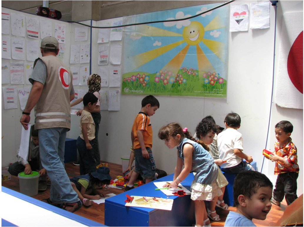
Iraqi refugee children being looked after by a volunteer of the Syrian Arab Red Crescent Society while their families are waiting to be registered with UNHCR in Damascus, Syria, © AI, June 2007

thirds of the 33,000 were attending schools in Greater Damascus. There are 5.3 million children attending schools in Syria nationwide.