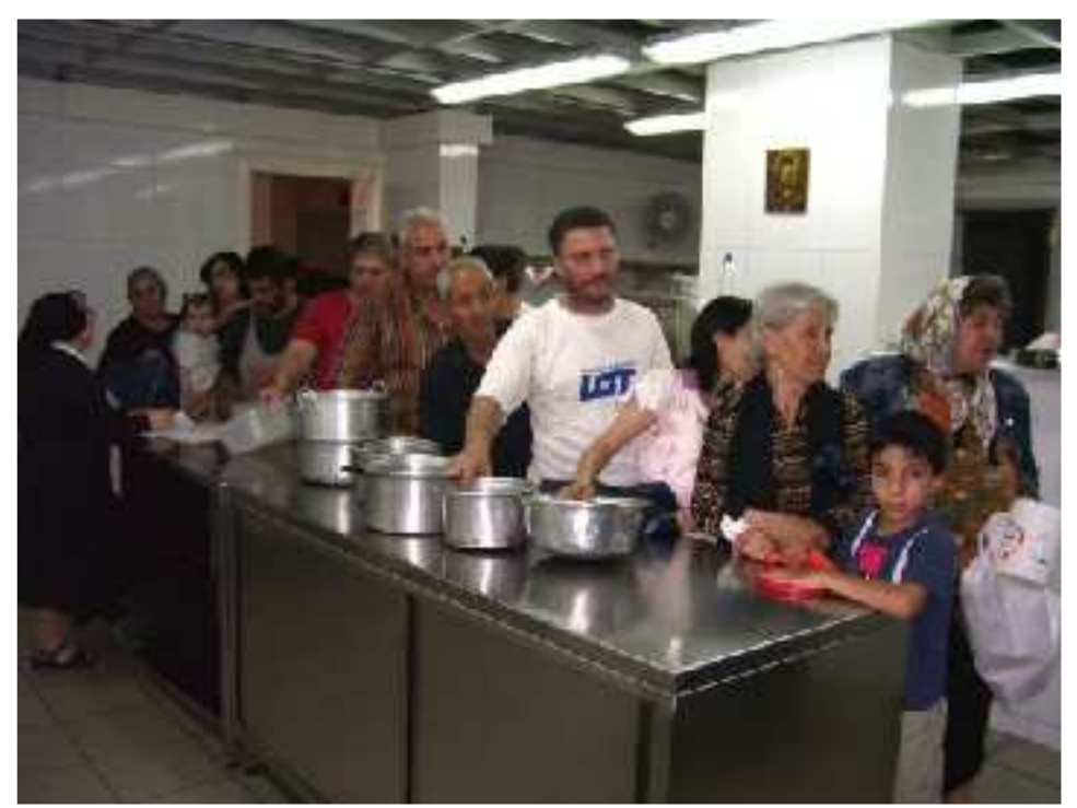
Iraqi families receive a cooked meal from a charity in the Jaramana district of Damascus, Syria, June 2007

When Iraqis cross the border their passports are stamped banning them from working. However, many Iraqis do take paid work illegally and they have become for local employers a cheap workforce. The Syrian authorities are aware of this and tolerate it. They have also taken advantage of the presence of professionals such as medical doctors, teachers and engineers among the Iraqi refugees by issuing them with work permits and allowing them to take jobs in Syria.