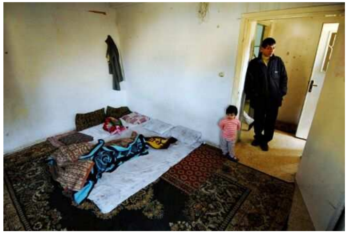
In Amman, most Iraqi refugees live in very basic and often crowded accommodation, © UNHRC/P.Sands, 12 September 2006

Amnesty International delegates were informed by a senior government official during their visit to Amman in September 2007 that the introduction of new visa restrictions, requiring that visas be issued before arrival at the border, was imminent. Such measures are aimed at clarifying the situation for many Iraqis who wish to leave Iraq and are currently selling their belongings to facilitate travel or taking real risks to reach the border, only to be turned away under the current approach to border entry operated by Jordanian officials. At present, only people with Jordanian residency, or certain categories of people such as those needing medical treatment certified by a hospital and those invited to attend seminars or conferences, are permitted entry. Amnesty International delegates were told by government officials that the intended