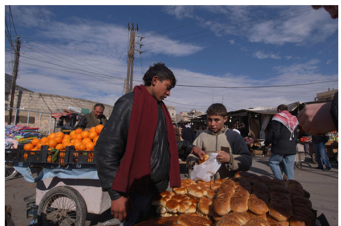
Iraqi refugees try to earn a living in the Sayida Zaynab market in Damascus

exception exists for certain professional categories,<sup>14</sup> the overall effect of this unwelcome measure will be a closed border for those needing to flee and obtain protection. Similarly, Amnesty International delegates were informed on their recent visit to the Jordanian capital Amman that the imposition of visa restrictions for Iraqis wishing to enter Jordan is imminent. If so, these new restrictions will further cut off Jordan as a safe haven. Earlier this year the Jordanian authorities introduced a severely restrictive border entry procedure whereby only those with residency permits or invitations for medical or educational purposes have been permitted to pass through the border.