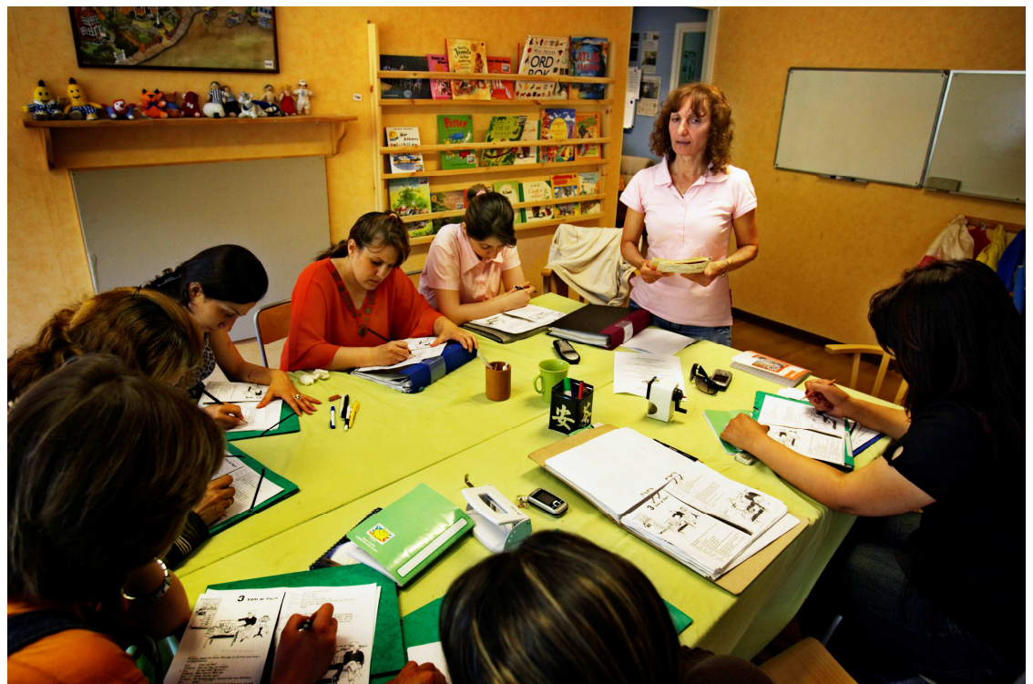
Iraqi refugees learn Swedish at a school in Södertälje, Sweden, © Panos Pictures, June 2006

As highlighted above, Amnesty International currently opposes all forcible returns to any part of Iraq. As such, in order to avoid a situation whereby individuals that reach the end of the asylum process become destitute and as such may be compelled to leave the host country due to the inability to meet their basic daily needs such as shelter, food and healthcare, rejected Iraqi asylum seekers should receive financial support and accommodation if needed with the same entitlements and rights as provided during the asylum process; be given permission to work; full access to health care, all levels of education and right to claim benefits until their situation is resolved.