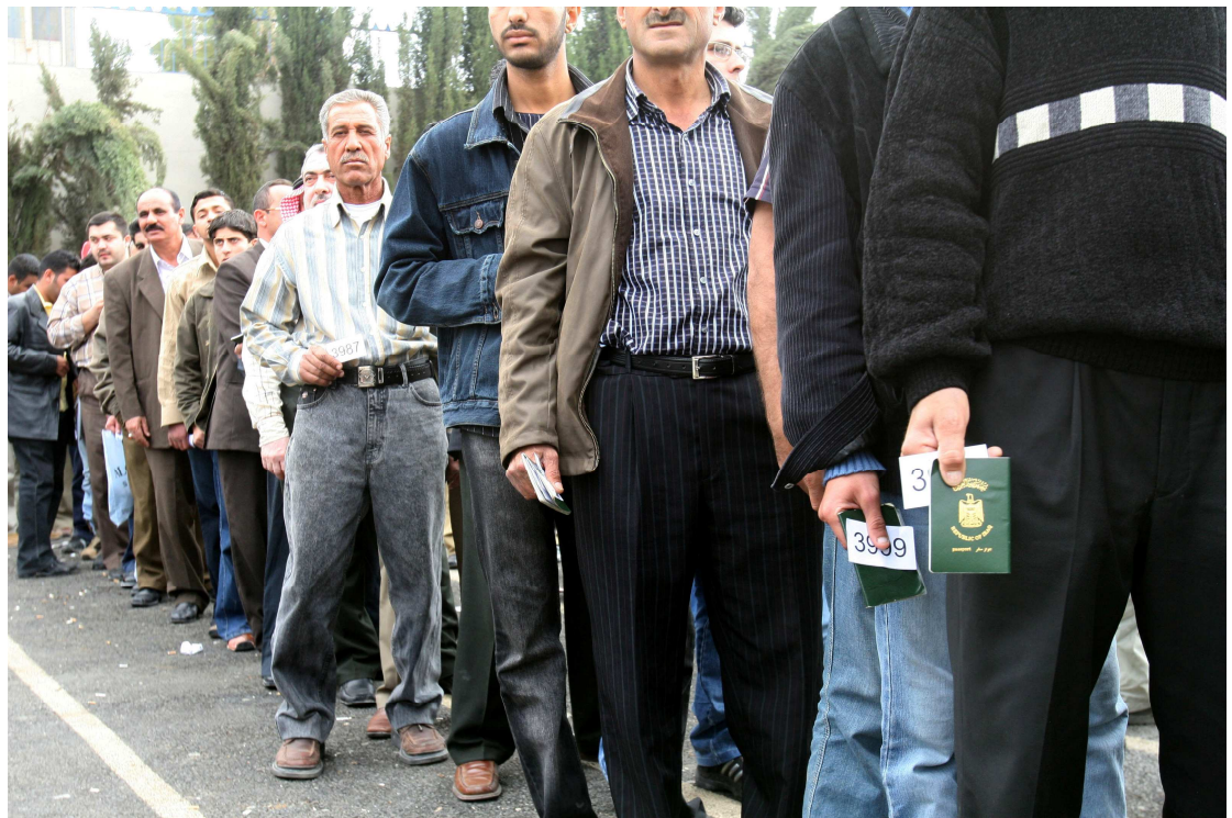
Iraqi refugees wait at a UNHCR office, near Damascus, Syria to register their names for residence, © Bassem Tellawi/AP/PA Photos, 23 April 2007

recent estimates suggest people are fleeing at faster rates than ever before. UNHCR recently predicted the number of newly displaced to be near 2,000 a day, equivalent to 80 an hour (day and night).<sup>9</sup>