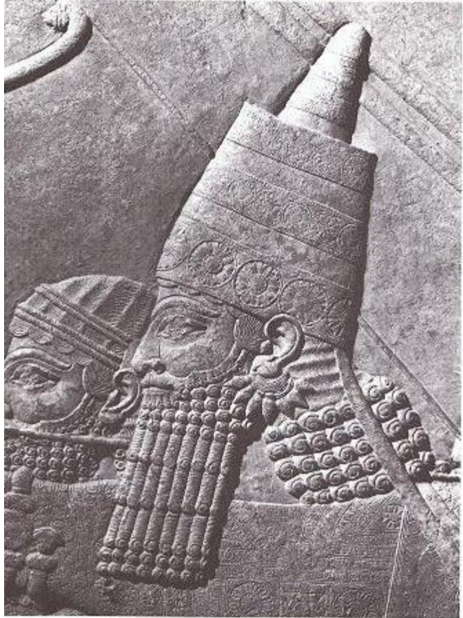
King Ashurbanipal, 669-627 B.C.. The excavations of his library provided a major source of Mesopotamian literature, including a good portion of the Epic of Gilgamesh.

So the trapper set out on his journey to Uruk and addressed himself to Gilgamesh saying, 'A man unlike any other is roaming now in the pastures; he is as strong as a star from heaven and I am afraid to approach him. He helps the wild