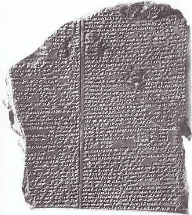
A fragment of a tablet showing the story of the flood, inscribed in Assyrian cuneiform characters.

-'Then was the launching full of difficulty; there was shifting of ballast above and below till two thirds was submerged. I loaded into her all that I had of gold and of living things, my family, my kin, the beast of the field both wild and tame, and all the craftsmen. I sent them on board, for the time that Shamash had ordained was already fulfilled when he said, "in the evening, when the rider of the storm sends down the destroying rain, enter the boat and batten her down." The time was fulfilled, the evening came, the rider of the storm sent down the rain. I looked out at the weather and it was terrible, so I too boarded the boat and battened her down. All was now complete, the battening and the caulking; so I handed the tiller to Puzur-Amurri the steersman, with the navigation and the care of the whole boat.